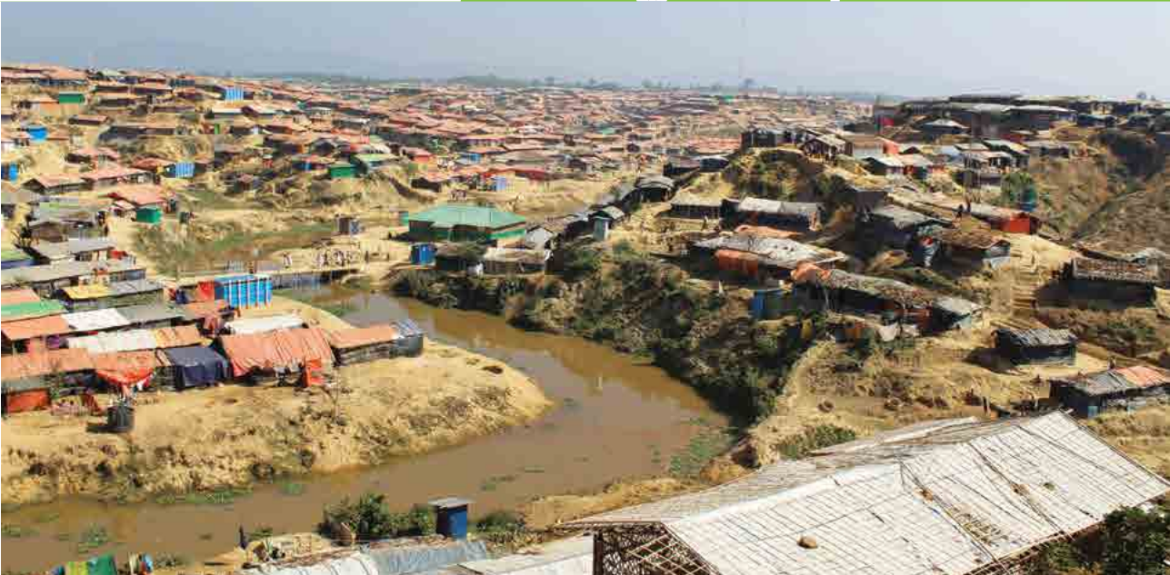
Modhur Chora canal in Balukhali camp, totally polluted