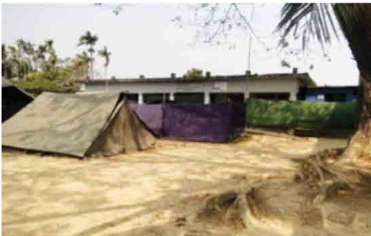
Kerontali Govt. Primary School, Teknaf