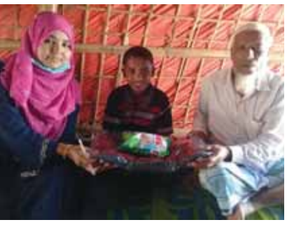
materials will help to Rohingya children are delighted to receive winter clothes and Milk Powder, Picture: William, MPC Supervisor

powder to meet up nutrition have been distributed to the most vulnerable 99 children that is under case management service. Among them adolescent boys are 42 and girls 57. Hopefully these mitigate their misery.