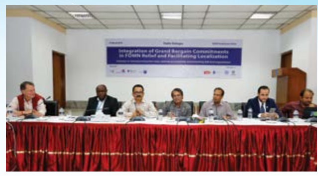
Tho podium of the public dialogue held on 3rd March 2018 in Dhaka. Diversified participants from donor organisations, INGO, local and national NGO, CSO and journalists attended the meeting

It should be noted that CCNF and COAST Trust have been doing this campaign since the beginning of Rohingya influx both in national and local level. A glimpse of those activities is available at www. cxb-cso-ngo.org. These two events are financially supported by Oxfam, Christian Aid, ICVA and IoM.