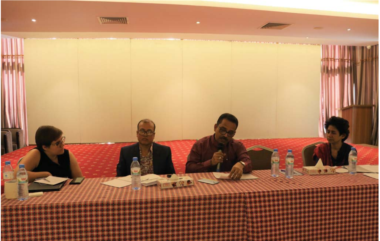
Annex- 1: Some photos of the workshop