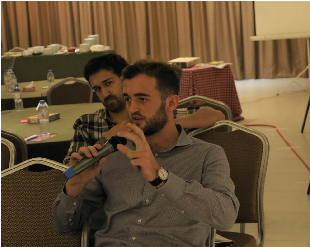
Questions and comments from participants.