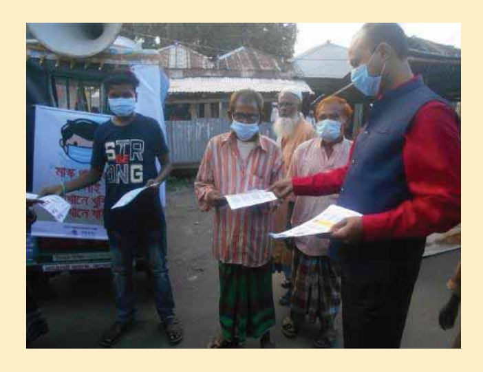
COVID awareness Miking & leaflet distribution Tazumuddin.