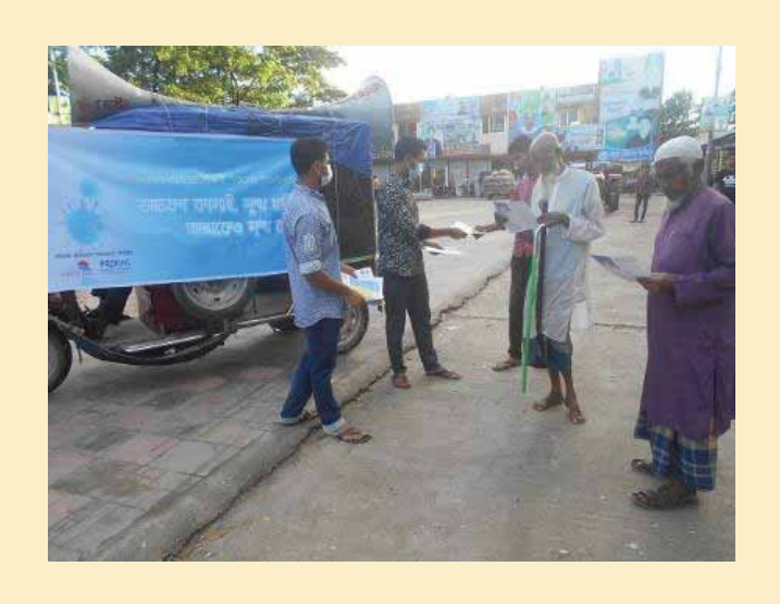
COVID awareness Miking & leaflet distribution, Borhauddin