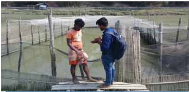
Provide technical advice to crab farmers