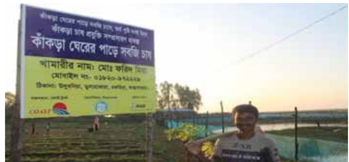
Cultivation of vegetables on the banks of the crab enclosure