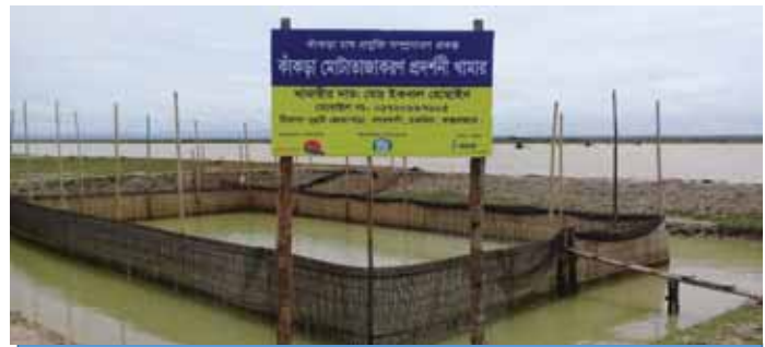
Crab fattening exhibition farm through grants