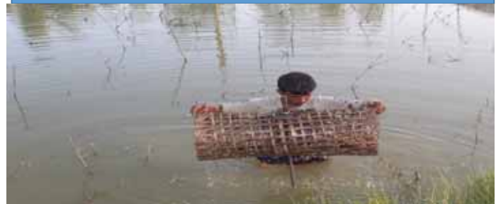
Crab extraction through tea