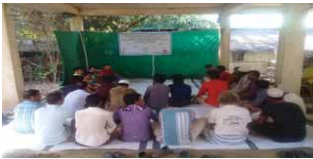
Training eith crab earmers