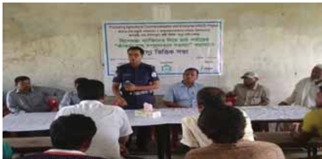
Issue based meeting to solve problems