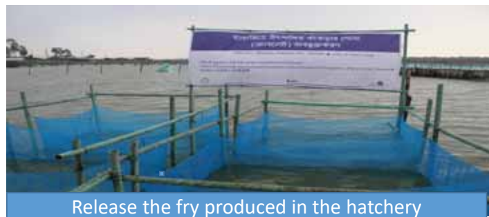
Release the fry produced in the hatchery