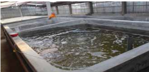
Crab chicks production in hatcheries Hatchery