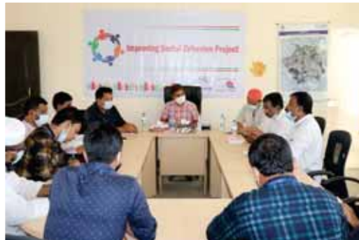
UP Standing committee members were talking with CiC about their findings.