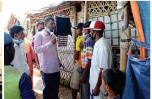
UP Standing committee members were talking with Rohingya during the visit.