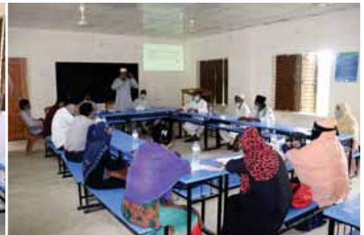
UP Standing committee members were talking with Rohingya during the visit.