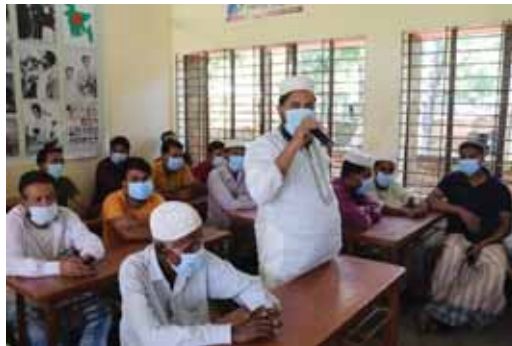
A committee member was talking during the feedback at Unchprang Bazar.