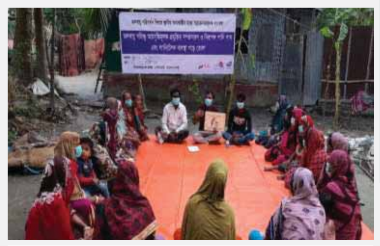
Campaign activities to expand Climate Adaptive Techniques to improve the socio-economic conditions of the community people in the climate-vulnerable areas, 21 Nov 21, Rahmatpur

They are facing a socio-economic crisis, the disease is increasing and their physical performance is declining as a result their income is decreasing. The main objective of this campaign is to raise awareness at the community level in isolated and climatevulnerable areas and to contribute to socio-economic development through practical life practice