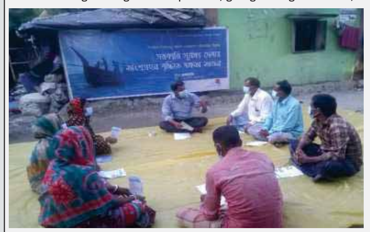
Regular meetings are being held with the fisher's group for building capacity to advocacy with local government agencies. 19 November 2021, Baraghop, Kutubdia, Cox's Bazar,

Fisherman registration is required to receive any humanitarian assistance from the government, but, many marginal fishermen in the coastal areas are being deprived of various government benefits due to a lack of registration. Notable reasons behind not having registration are staying in the city in search of alternative income during the registration process, going fishing in the sea,