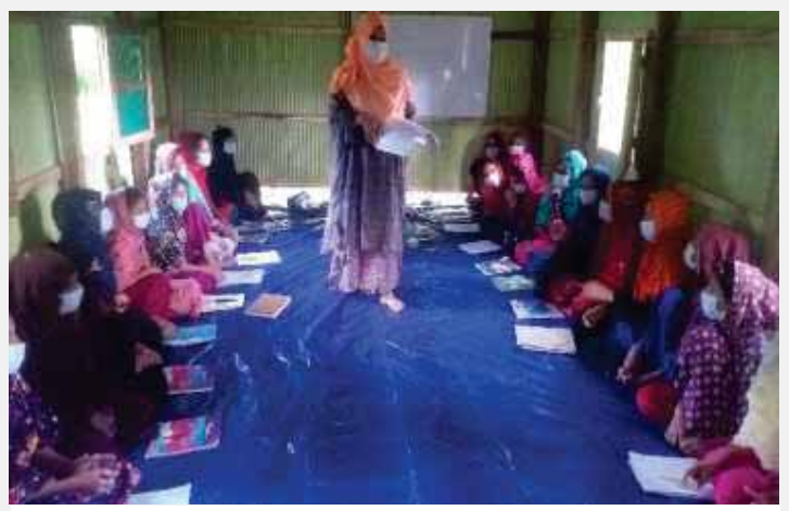
Teacher of Adolescent Centers are conducting session on life skills education - Monpura Bhola, 24 September 2021, Pic: COAST.

One of the main objectives of the CJRF project is to empower school dropout adolescents by providing life skills education. Geographically Bangladesh is one of the most natural disaster-prone countries. The coastal areas, which are separated from the mainland of the country, are the worst sufferers due to calamities. Most of the people living in these coastal areas are farmers and fishermen by profession. They are being severely affected professionally by adverse effects of climate change