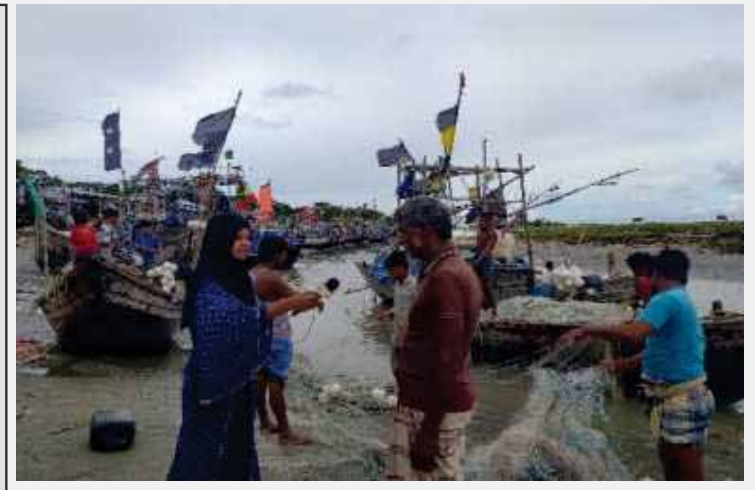
Radio Meghna staff is taking interviewing and broadcasting live program of seagoing fishermen - Khejur Gachhia, Char Fashion, Bhola, 28 September

With the support of COAST CJRF project, Coastal Community Radio Meghna is broadcasting a series of programs and the plights of coastal fishermen are coming up.