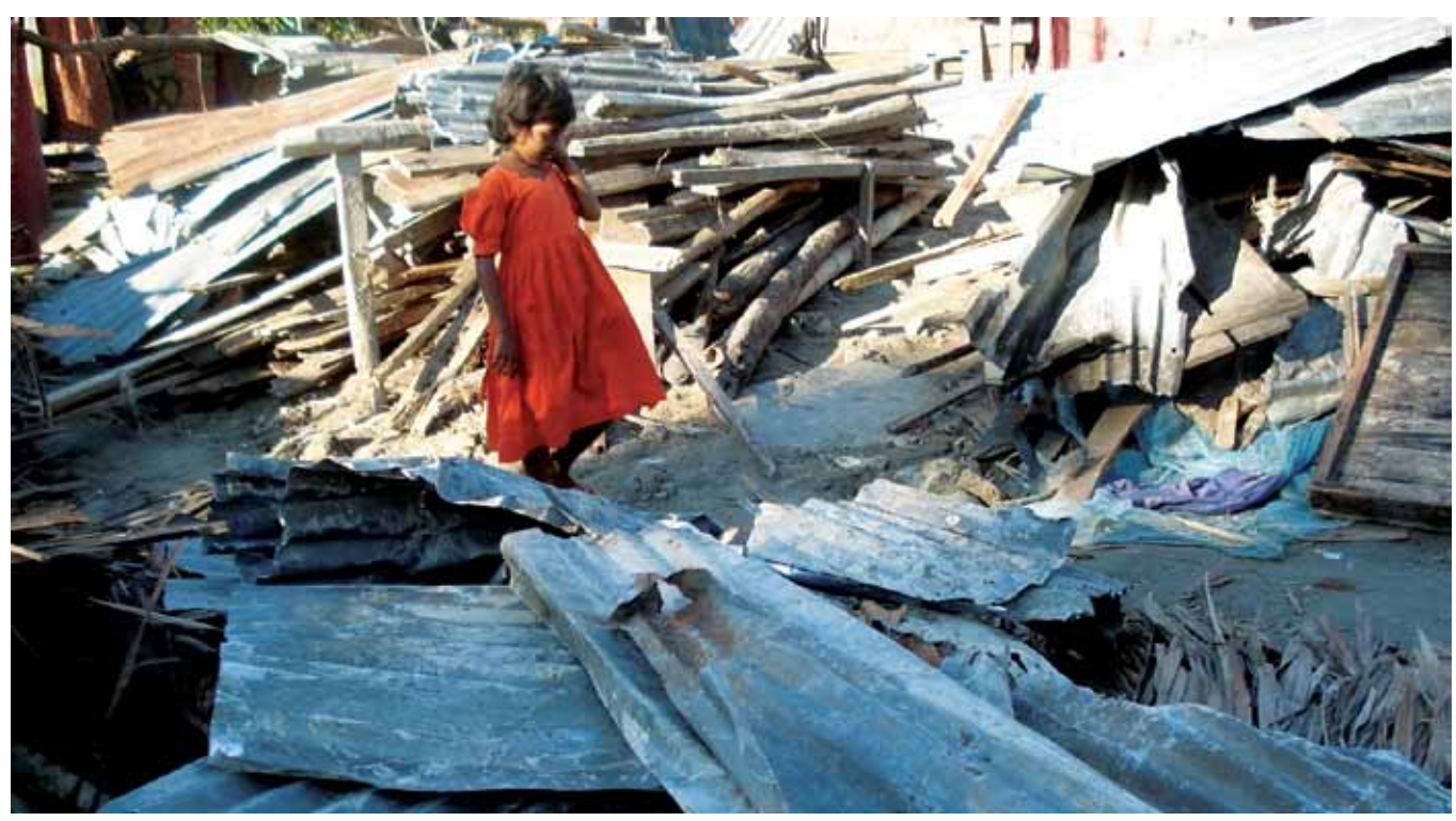
The six years old girl was trying to find out her parents who were lost in the clyclone Sidr previous night (2007)