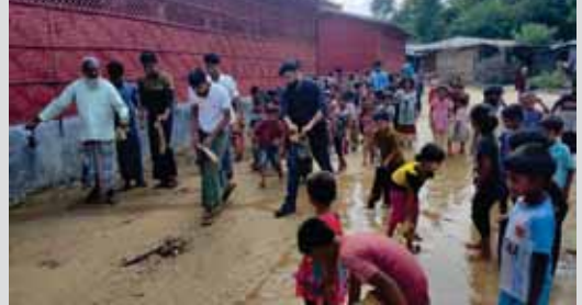
Community members participated in cleaning activities during observing the day.

ya Refugee camp with the coordination of Inter-Sector Coordination Group (ISCG). In 20th October, 2022 COAST Foundation also observed the day with specific target. There are 84 learning centers and 50 Early Childhood Development Center in Camp 14 leading