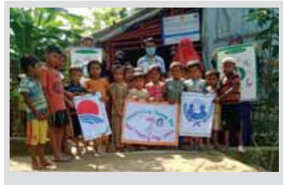
Handwashing and camp cleaning day observation.