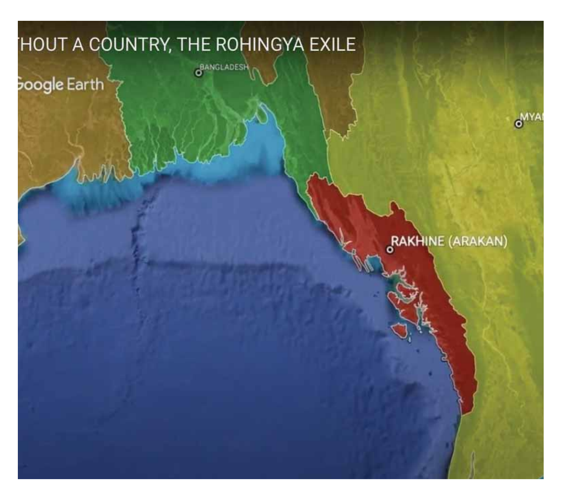
Rohingyas are not Bangalese, they are from Arakan or Rakhaine state