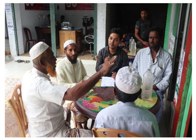
KII with Bazar management committee and local businessmen at Unchiprang bazar_PC- Sabina